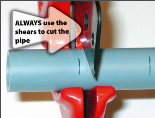
1. Cut the pipe